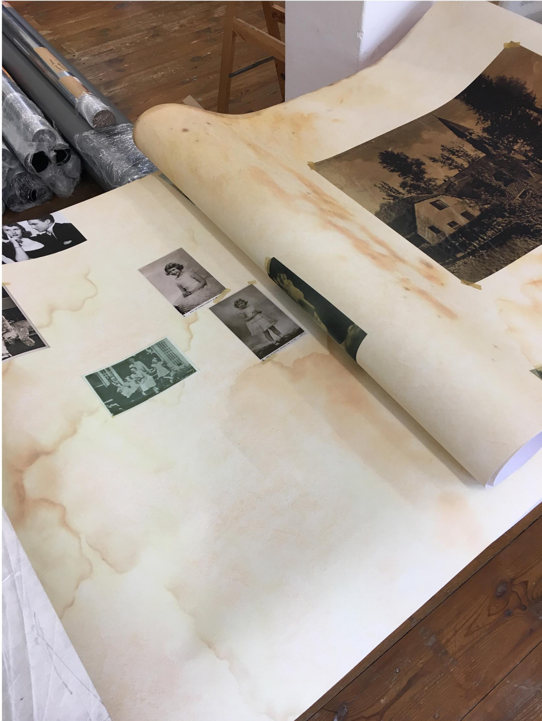
Studio Process: Replica wallpaper printing