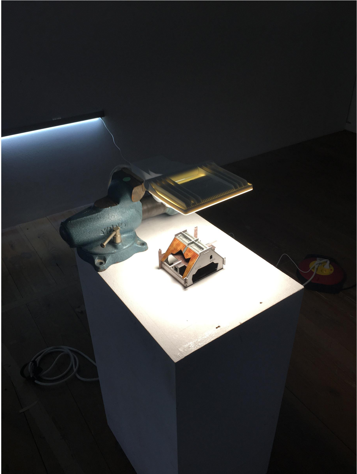
Studio Process: Secret Annex model section